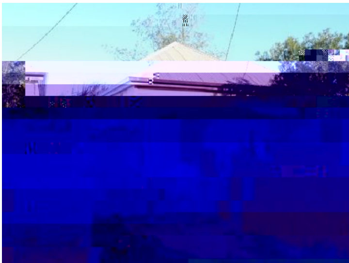
Photo Description: 6/08/2008 Tanya Henkel House set behind front brick wall.

Map Reference: 15.17 GPS Northing: 6816088.00 GPS Easting: 267304.000 0000 000