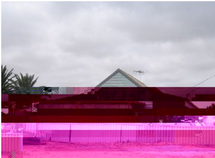
Photo Description: 18/01/2008 Rod Milne Simple structure with new cladding.

Map Reference: 16.2 GPS Northing: 6820216.00 GPS Easting: 268237.000 0000 000