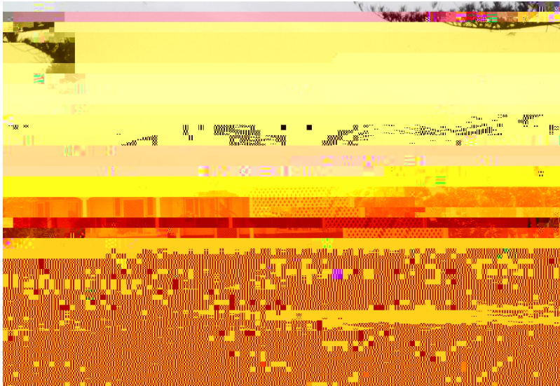
Photo Description: 6/11/1996 Suba & Grundy Tall chimneys punctuate the roofscape.