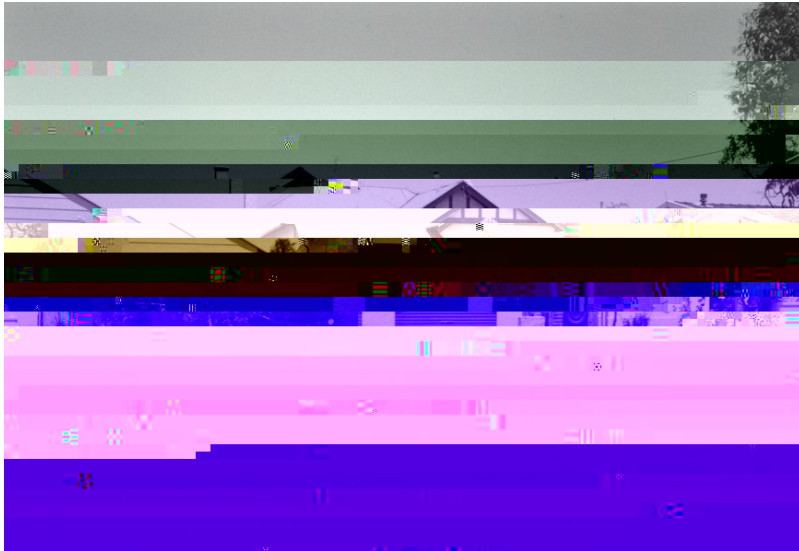
Photo Description: 25/10/1996 Suba & Grundy Tall chimney punctuates roofscape.