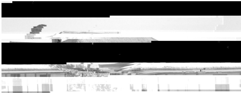
Photo Description: 14/10/1996 Suba & Grundy House fronts directly onto footpath.