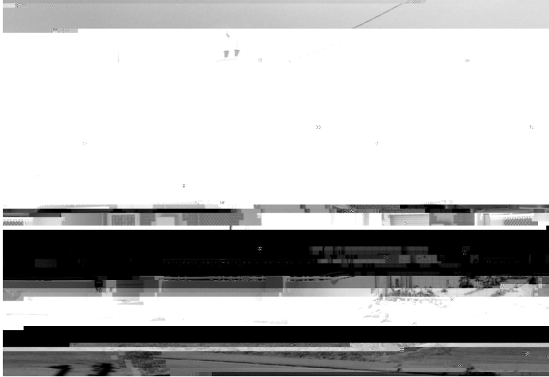
Photo Description: 14/10/1996 Suba & Grundy Tall chimneys a feature.