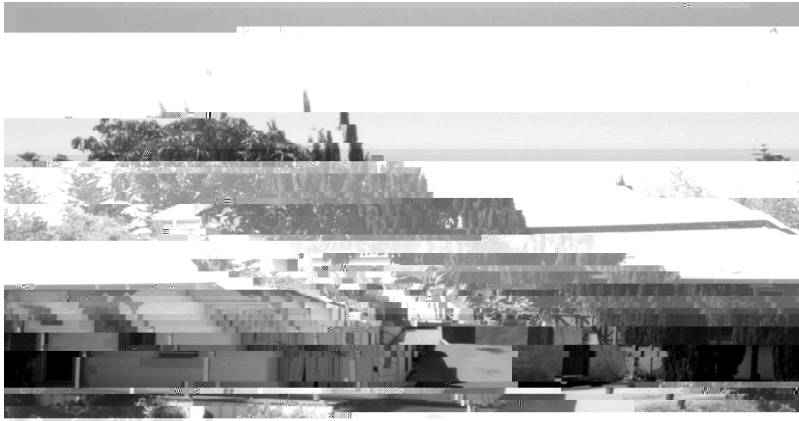
Photo Description: 14/10/1996 Suba & Grundy View showing decorative veranda h brackets.