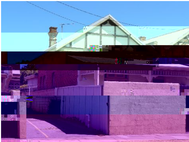
Photo Description: 13/04/2008 Tanya Henkel Set behind a high brick fence.

Map Reference: 14.15 GPS Northing: 6814218.00 GPS Easting: 266226.000 0000 000