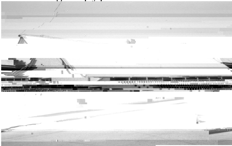
Photo Description: 14/10/1996 Suba & Grundy Building fronts directly onto footpath.