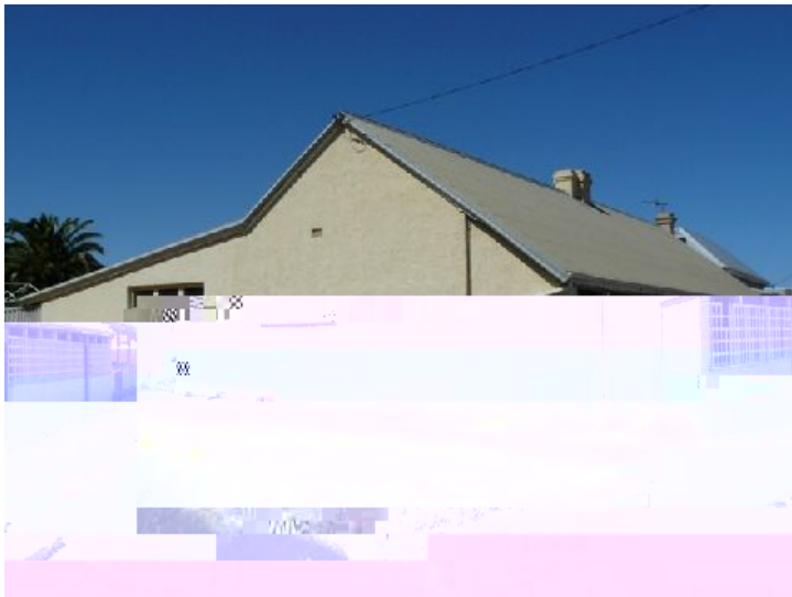
Photo Description: 13/04/2008 Tanya Henkel View showing steeply pitched roof.

Map Reference: 14.15 GPS Northing: 6814232.00 GPS Easting: 266284.000 0000 000