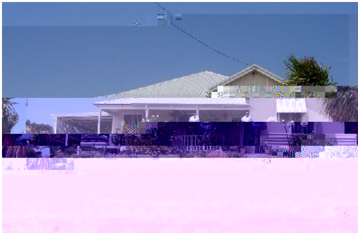
Photo Description: 14/11/2007 Rod Milne Set above the street level

Map Reference: 15.14 GPS Northing: 6813387.00 GPS Easting: 267632.000 0000 000