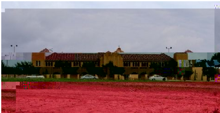
Photo Description: 30/07/2007 Rod Milne East facade of Nazareth House.

Map Reference: 15.2 GPS Northing: 6819716.00 GPS Easting: 267738.000 0000 000