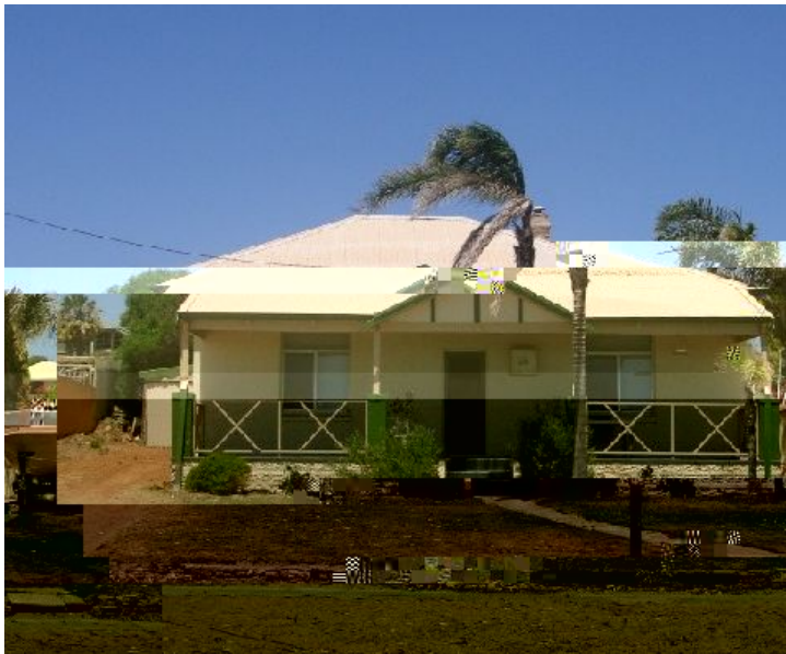
Photo Description: 10/01/2008 Rod Milne Entry gable enhances street facade.

Map Reference: 15.17 GPS Northing: 6817237.00 GPS Easting: 267458.000 0000 000