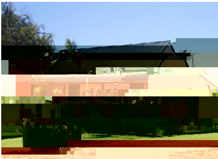
Photo Description: 31/10/2007 Rod Milne View of the house from Burges Street.

Map Reference: 14.15 GPS Northing: 6814148.00 GPS Easting: 265780.000 0000 000