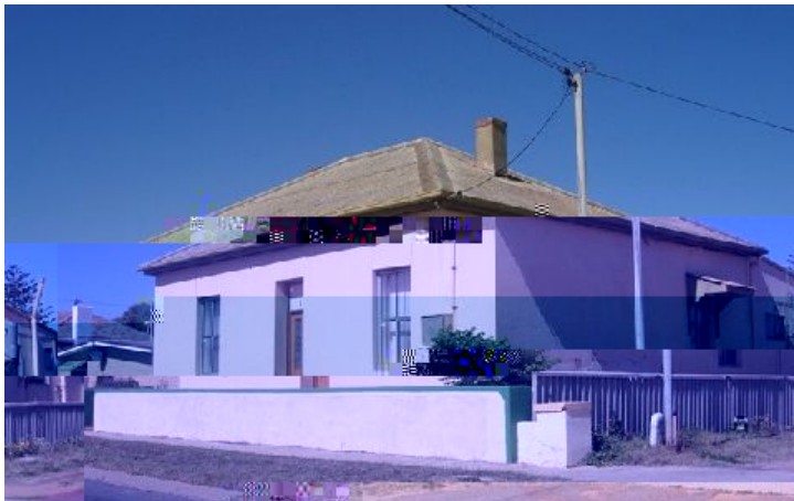
Photo Description: &fififl lzl l 3 4# / . " ~ 5 ~ " ~ " 1 ~ 6 # 7 ~ / 8 # 6 / 8 # / 8 - " ~ ~ 2