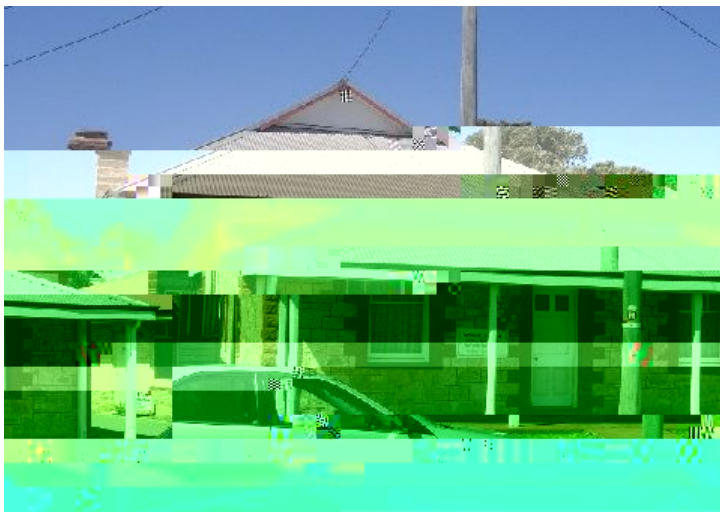
Photo Description: 19/11/2007 Rod Milne Stone building with feature quoining.

Map Reference: 15.15 GPS Northing: 6814967.00 GPS Easting: 267075.000 0000 000