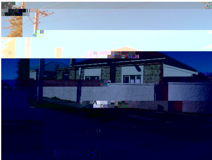
Photo Description: 26/06/2009 Tanya Henkel Stone house set behind a tall rendered wall.

Map Reference: 14.14 GPS Northing: 6814094.00 GPS Easting: 266436.000 0000 000