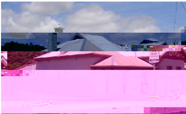
Photo Description: 18/12/2007 Rod Milne Brickwork painted light blue.

Map Reference: 15.14 GPS Northing: 6814736.00 GPS Easting: 266952.000 0000 000