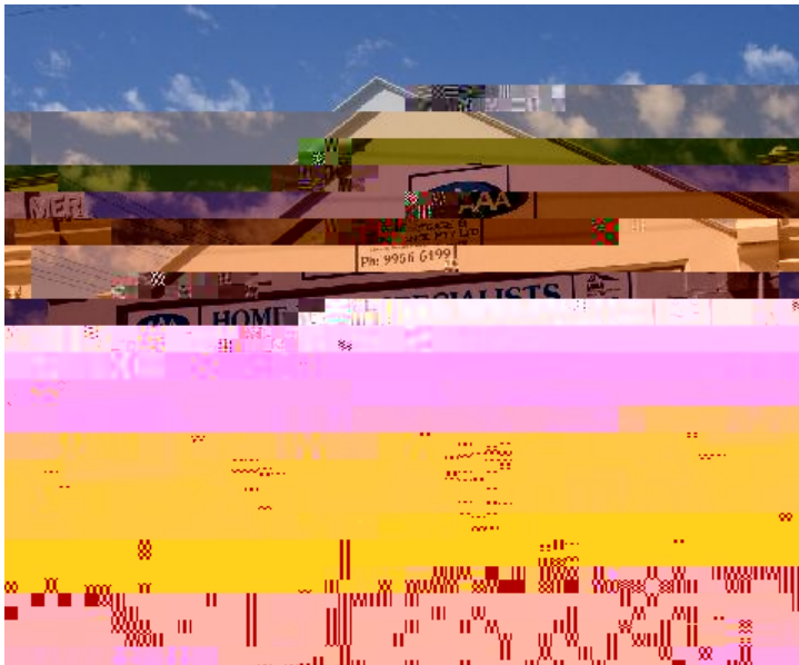
Photo Description: 14/12/2007 Rod Milne Front facade painted white.

Map Reference: 15.15 GPS Northing: 6814791.00 GPS Easting: 266882.000 0000 000